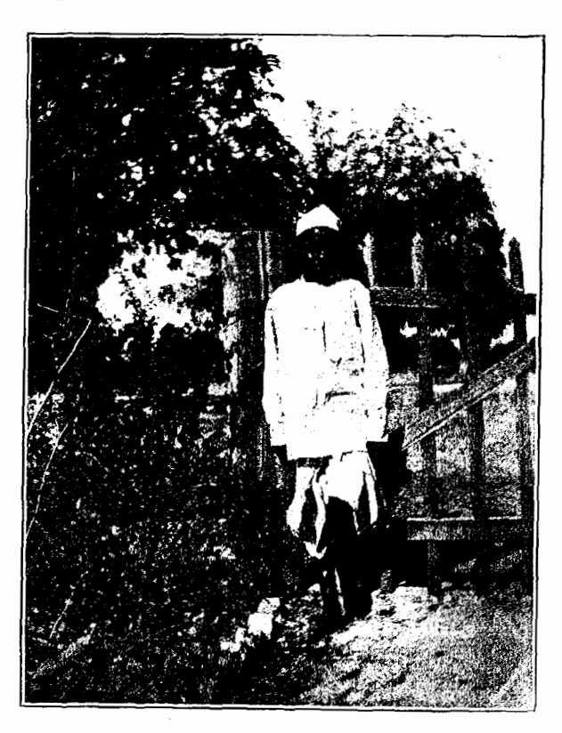
The Jewel after eighteen months of polishing.

Do pray for this dear child. Though he has suffered much he never complains but displays a patience that is almost superhuman. He is looking for the near coming of Jesus and we believe he is truly one of the precious jewels that are to be gathered "from every tribe and nation."